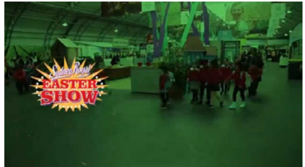
EMMA AYLIFFE ASK WHICH ARE GOOD BUGS AND BAD BUGS FOR COTTON CROPS